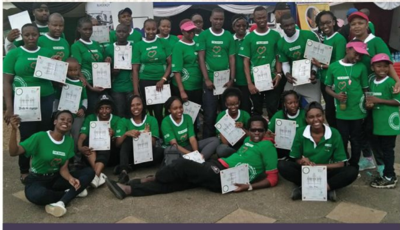
The ABC Bank team pose with their certificates after completing the Mater Heart Run that was held on 25th May 2019. ABC Bank was one of the sponsors of the Mater Heart Run 2019.