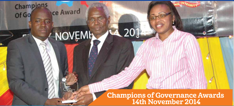
Champions of Governance Awards 14th November 2014