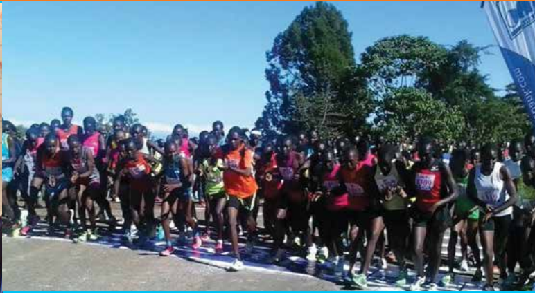
21 km women flag off