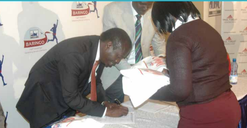
Baringo County Governor Benjamin Cheboi signs up for the marathon during the official launch on 25th September

The children at (KSCRH) appreciate foodstuffs the staff donated to them to light up their Christmas